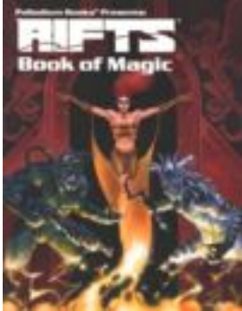
Rifts® Book of Magic™

Can you handle 600 pages of Rifts®? Rifts® Game Master Guide™ contains 600 pages of magic spells, O.C.C.s, R.C.C.s, adventures, Game Master tips, 101 adventure ideas