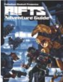
Rifts® Adventure Guide

The spell you always wanted could be inside these pages!